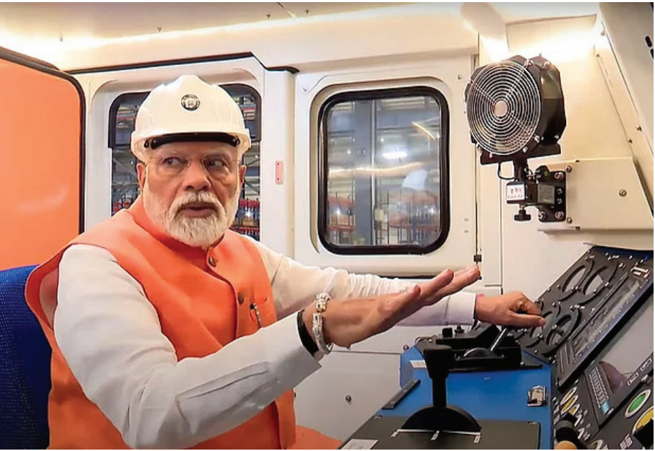
Prime Minister Narendra Modi during dedication of the Loco Manufacturing Shop in Dahod to the nation.