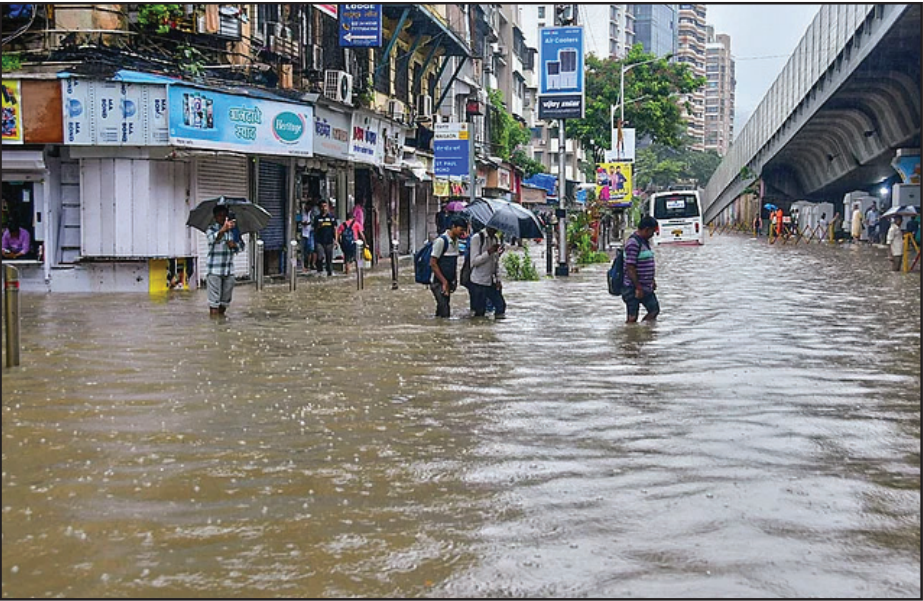
Pedestrians cross an inundated road amid rains, in Mumbai on Monday.

(Standard Post Bureau) Mumbai, May 26 : Chief Minister Devendra Fadnavis is reviewing the situation caused by widespread excessive rains across Maharashtra and has asked the entire administration to be in alert mode. The Chief Minister office ( CMO) said in statement on Monday that the CM has ordered immediate Panchnama in places where damage has occurred. He is in constant touch with the chief secretary of the state and the state disaster management cell.Heavy rains affected normal life in Pune, Satara, Solapur, Raigad, Mumbai and MMR areas in the state. As many as 25 houses have partially collapsed in Baramati, seven people trapped in the flood have been rescued and 80 families have been shifted to safer places, said the Chief