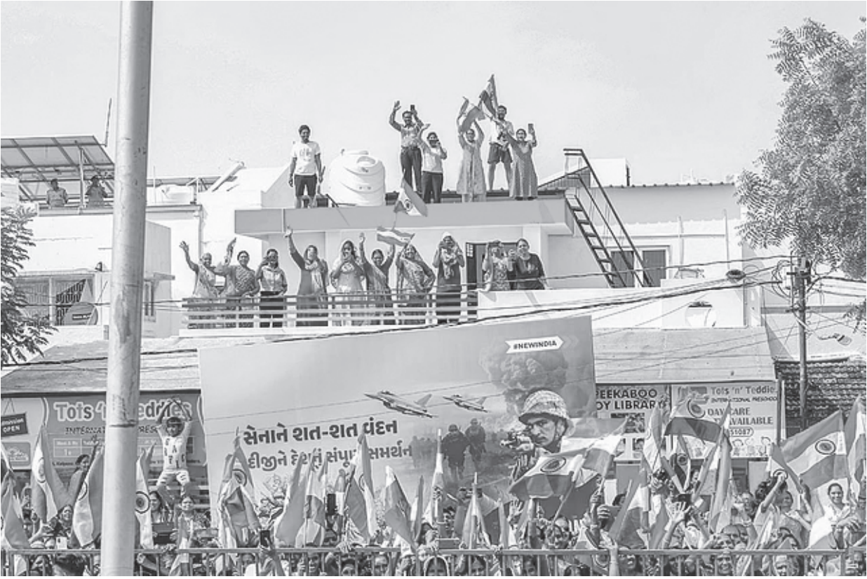
Supporters at Prime Minister Narendra Modi's roadshow in Vadodara, Gujarat on Monday.

remarked. Calling out the contradiction, Subhash cited Revanth's recent participation in the NITI Aayog meeting chaired by the Prime Minister. “He boasted of Telangana's development there, while back home, students in Gurukulas don't even have basic facilities,” he noted. He criticised the government for failing to address pending student scholarships and for its hollow announcement of constructing permanent Gurukula buildings. “Over 600 Gurukula institutions are housing 7 lakh students. Most are functioning out of private buildings, with rent dues totalling Rs 215 crore. As many as 63 landlords have issued eviction notices. Is this the ‘revolution’ Revanth promised?” Subhash questioned. He also pointed to the deteriorating state of the state's universities, where faculty recruitment has stalled and infrastructure is in decline. “Instead of misleading people with grandstanding and false bravado, Chief Minister Revanth Reddy should focus on reviving Telangana's economy and delivering real governance, not theatrics,” Subhash asserted.