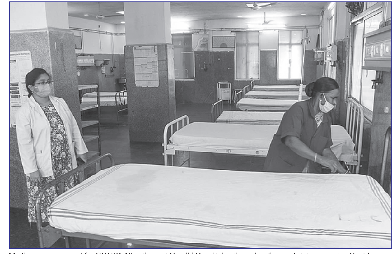
Medics prepare a ward for COVID-19 patients at Gandhi Hospital in the wake of several states reporting Covid cases, in Hyderabad on Saturday.

as they did not get MSP for paddy, tobacco, mirchi and other horticulture produce while prime land in Visakhapatnam has been given away to favoured industrialists at throwaway prices, he alleged.