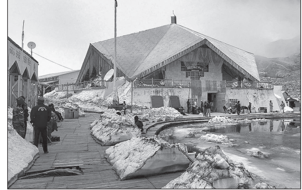
Preparations underway at Gurudwara Hemkund Sahib ahead of its opening for public, in Chamoli district, Uttarakhand. The gurudwara is scheduled to be opened on May 25.

Jammu, May 24 (UNI) Apprehending misuse of mobile data by anti-national elements and miscreants, Jammu and Kashmir Home Department has temporarily suspended mobile data