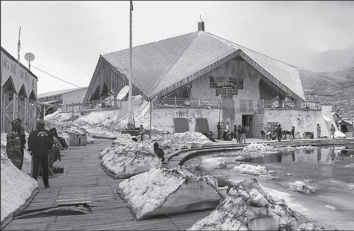
Preparations underway at Gurudwara Hemkund Sahib ahead of its opening for public, in Chamoli district, Uttarakhand. The gurudwara is scheduled to be opened on May 25.

"In the interest of the sovereignty and integrity of India, the security of the State/UT, and for maintaining public order, I am satisfied that the action taken by the authorized officer was necessary," read the order issued by the Principal Secretary to the Government, Home Department. The service providers and internet service providers however, are directed to ensure compliance with the order for the entire duration specified.