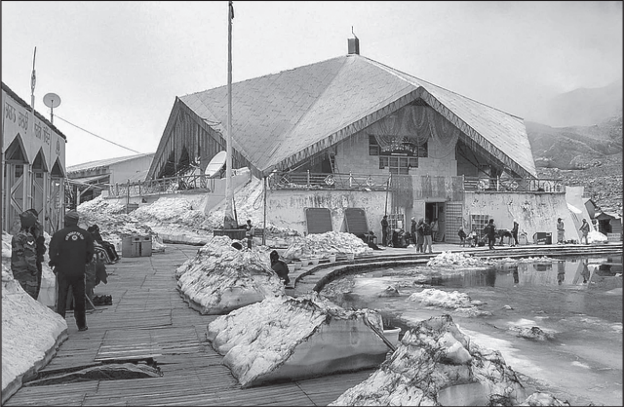
Preparations underway at Gurudwara Hemkund Sahib ahead of its opening for public, in Chamoli district, Uttarakhand. The gurudwara is scheduled to be opened on May 25.

“In the interest of the sovereignty and integrity of India, the security of the State/UT, and for maintaining public order, I am satisfied that the action taken by the authorized officer was necessary,” read the order issued by the Principal Secretary to the Government, Home Department. The service providers and internet service providers however, are directed to ensure compliance with the order for the entire duration specified.