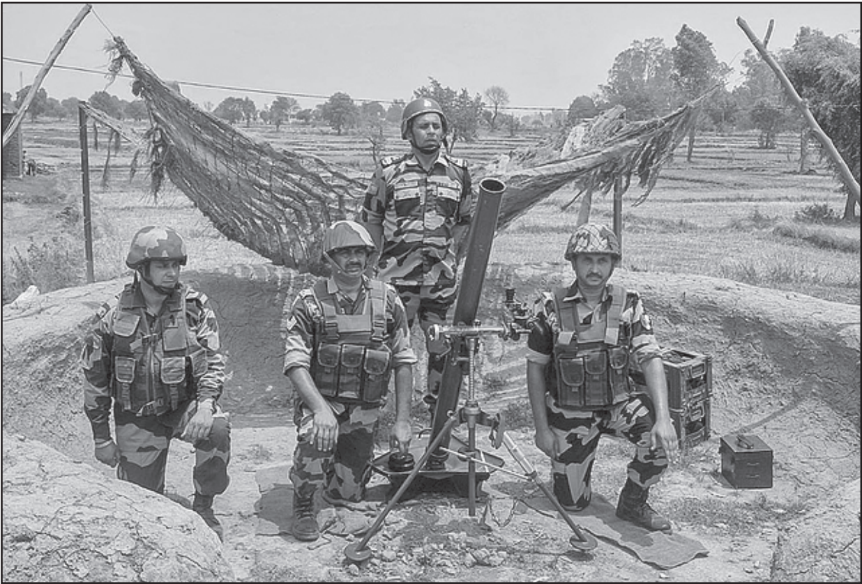
Security personnel display the preparedness near the International Border, during a media tour, on the outskirts of Jammu on Wednesday.

dedication and consistent efforts of police personnel across the state. He urged officers to continue striving for excellence, uphold integrity, and strengthen public trust through sincere service. Director General of CID, Shikha Goel, elaborated that the 52 officers were chosen after a detailed review of their performance in 2024. The evaluation covered key areas such as grave crime detection, securing convictions, liquidation of undetected cases, execution of non-bailable warrants, timely disposal of POCSO cases, high performance in National Lok Adalats, recovery of funds in cybercrime cases, and detection of property offences. In addition to individual recognitions,