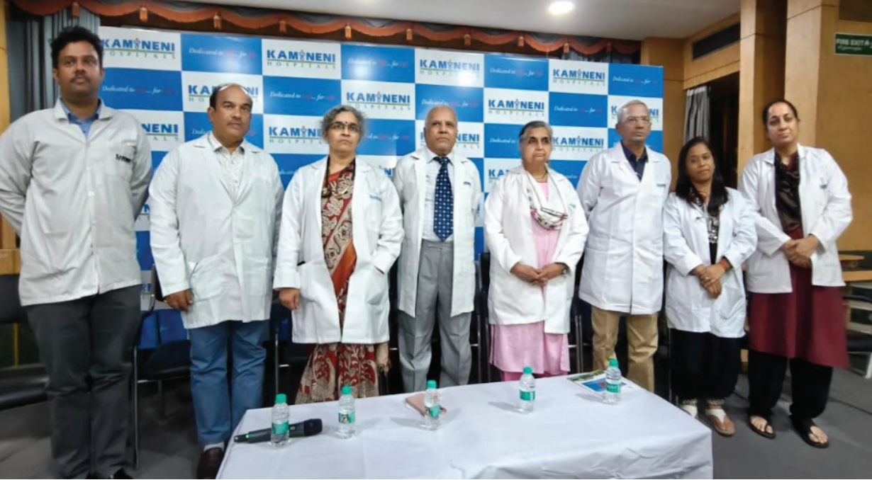
(Standard Post Bureau)

The study adds to a growing body of work showing that age is not just a chronological number, but a biological factor that can shape therapy response. The researchers called for age to be systematically considered in the development and evaluation of cell-based immunotherapies.