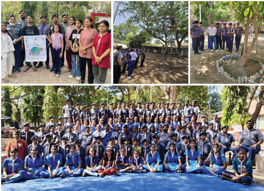
Glimpses of various activities and group photo of the 5th District Rally held at State Training Centre, Gholvad by Western Railway State Bharat Scouts & Guide.