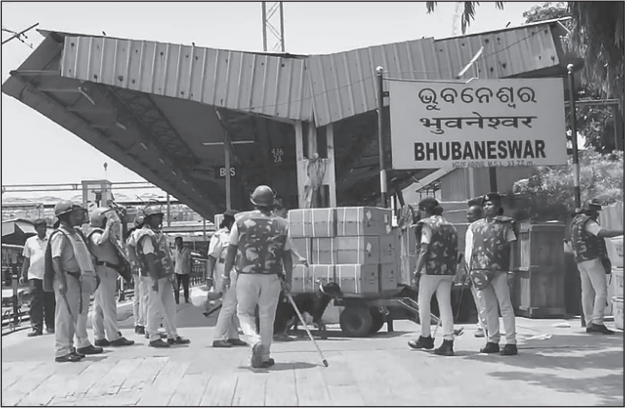
Security personnel with a sniffer dog inspect luggage at a platform at the Bhubaneswar Railway Station. Security has been beefed up at the station in the wake of the recent Pahalgam terror attack.

The Prime Minister reiterated the commitment to the vision of "Make AI in India" and the goal to "Make AI work for India." He further noted the budgetary decision to expand IIT seat capacities and introduce Meditech courses, combining medical and technology education, in collaboration with IITs and AIIMS. Modi appealed the timely completion of these initiatives, with a focus on positioning India among the "best in the world" in future technologies.