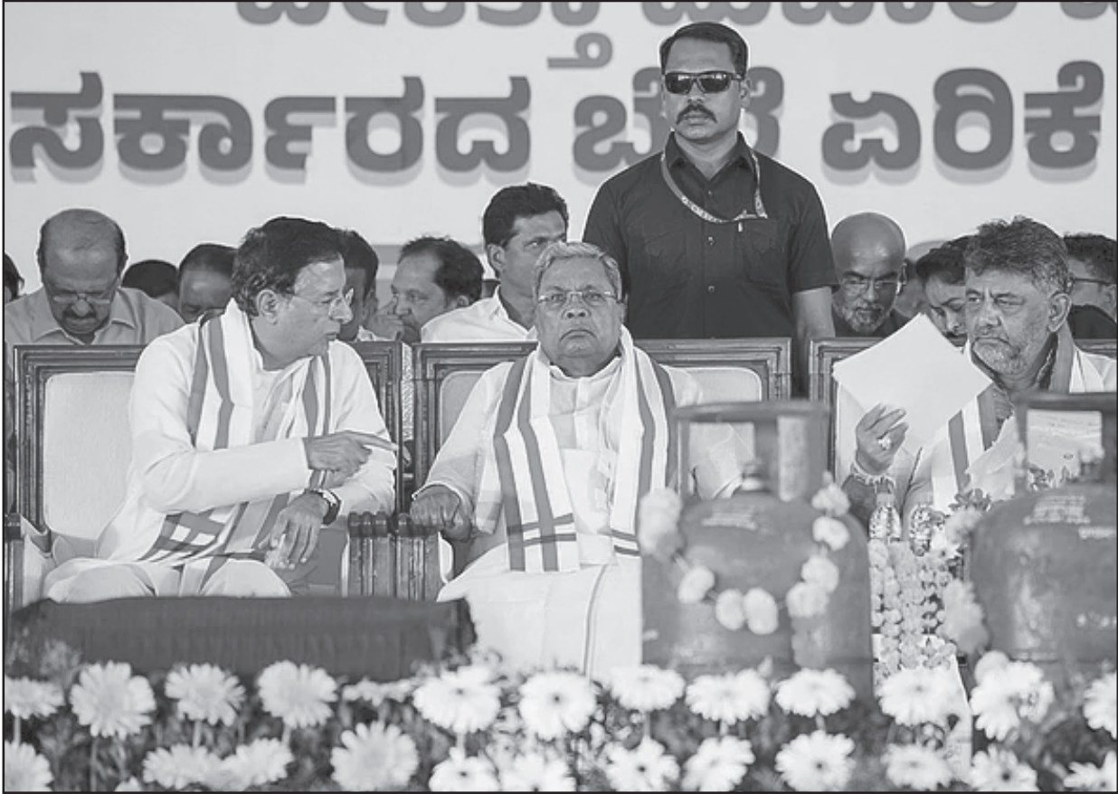
Karnataka Chief Minister Siddaramaiah with his Deputy DK Shivakumar and Congress leader Randeep Surjewala during a party conference to condemn the Central Government over alleged rising prices of essential items, in Belagavi.