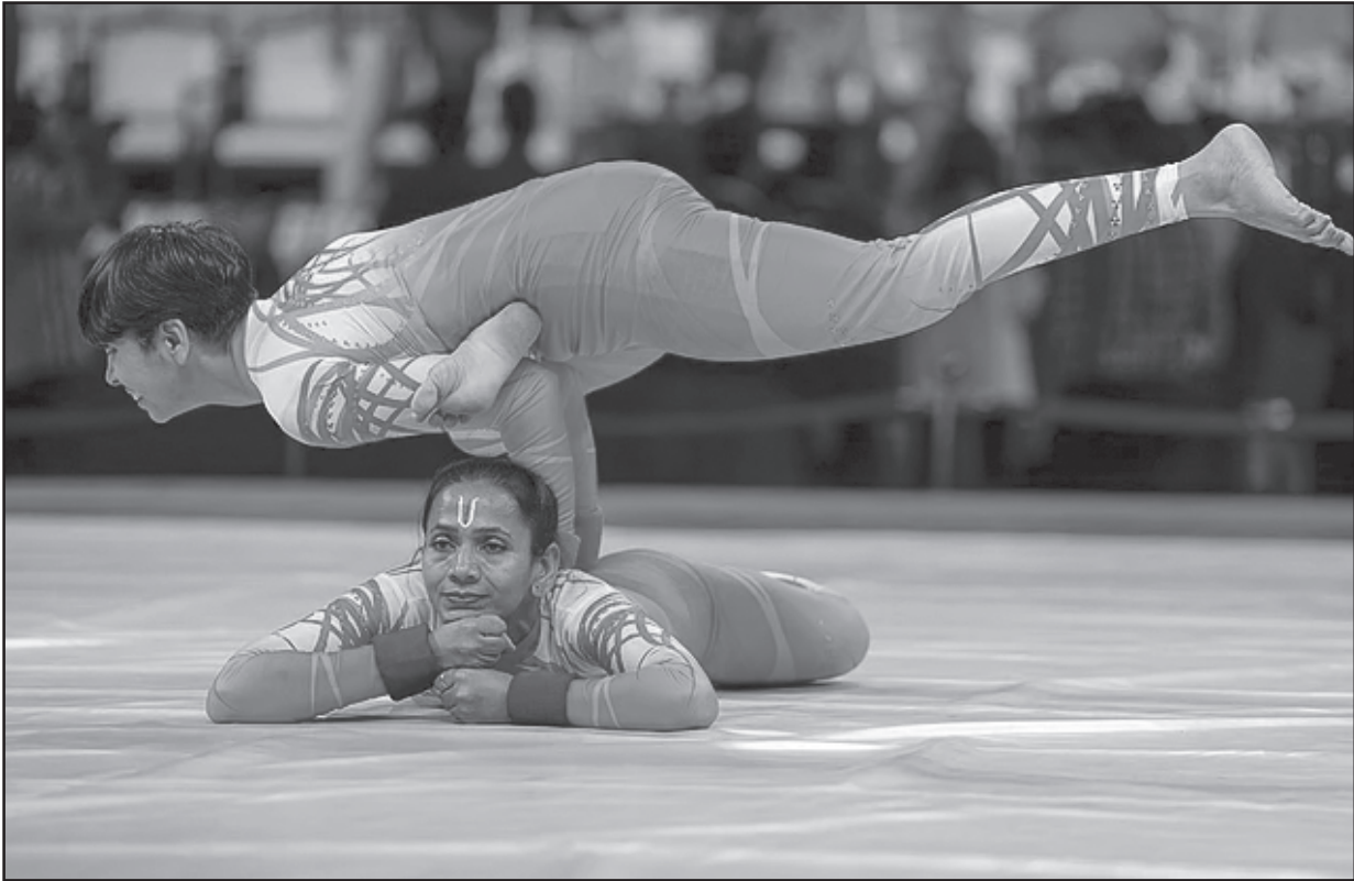
Participants perform yoga postures during the 2nd Asian Yogasana Sport Championship, in New Delhi on Saturday.

Everton have only won one of their past nine matches and remain 13th.