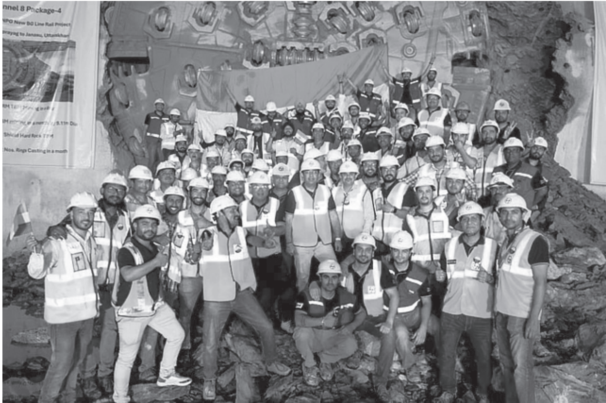
Larsen & Toubro (L&T) staff and engineers celebrate the break-through of India’s longest rail tunnel in Janasu, Uttarakhand. The 14.57 km long tunnel between Devprayag and Janasu achieved a breakthrough on April 16, 2025 in the presence of Railway Minister Ashwini Vaishnaw.