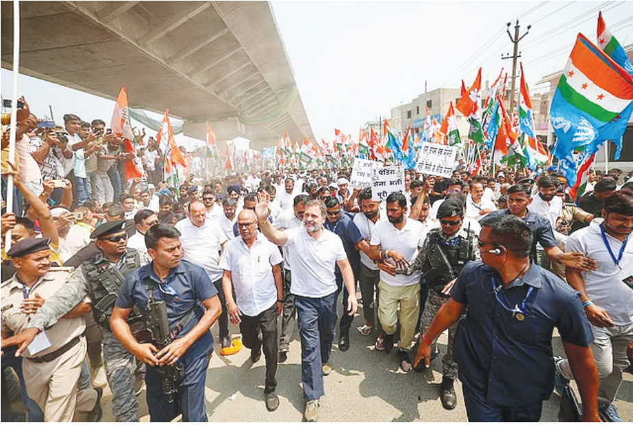
Congress leader and LoP in the Lok Sabha Rahul Gandhi during the 'Palayan Roko Naukri Do Yatra', in Begusarai on Monday.

Pad Yatra was taken out from Bhittharwa under the leadership of firebrand Congress leader Kanhaiya Kumar. Pad Yatra will culminate in Patna on April 11. Congress is trying to connect itself with youths of Bihar for their support in state assembly elections to be held in October-November this year. Issues relating to Jobs for youths and their migration to other states for livelihood, were being raised vigorously in Bihar in election year.