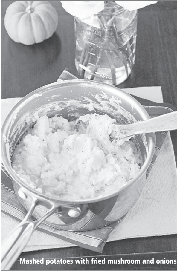
Mashed potatoes with fried mushroom and onions