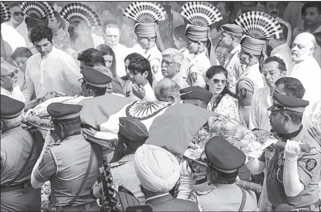
Police personnel carry the mortal remains of veteran actor-filmmaker Manoj Kumar during his last rites, in Mumbai. Kumar, popularly known as 'Bharat Kumar' for his portrayal of patriotic heroes in films such as "Upkar" and "Kranti", was cremated with full state honours and a three-gun salute.

“Approximately 70 percent of people experience knee pain at some point in their lives. Out of these, 10-20 percent of patients have to undergo