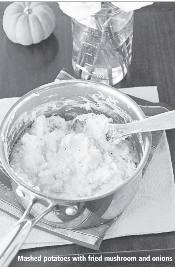
Mashed potatoes with fried mushroom and onions