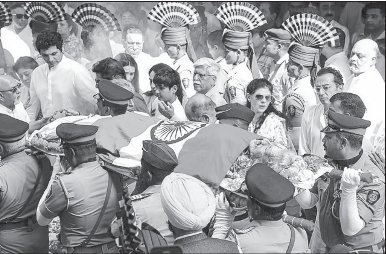
Police personnel carry the mortal remains of veteran actor-filmmaker Manoj Kumar during his last rites, in Mumbai. Kumar, popularly known as 'Bharat Kumar' for his portrayal of patriotic heroes in films such as "Upkar" and "Kranti", was cremated with full state honours and a three-gun salute.

Shinde claimed that people voted for the Mahayuti candidates in assembly elections due to many development projects he implemented during his two and half years regime.