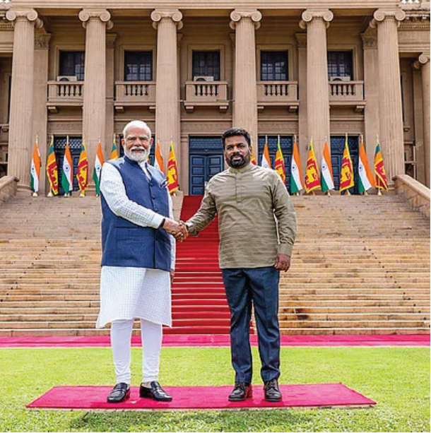
In this image released by PMO, Prime Minister Narendra Modi and Sri Lankan President Anura Kumara Dissanayake before delegation level talks at the Presidential Secretariat, in Colombo, Sri Lanka on Saturday.

Colombo/New Delhi, April 5 (UNI) : India and Sri Lanka inked their first MoU on defence cooperation and a trilateral cooperation with the UAE on development of Trincomalee into an energy hub, as Prime Minister Narendra Modi held talks with Sri Lankan President Anura Kumara Dissanayake.