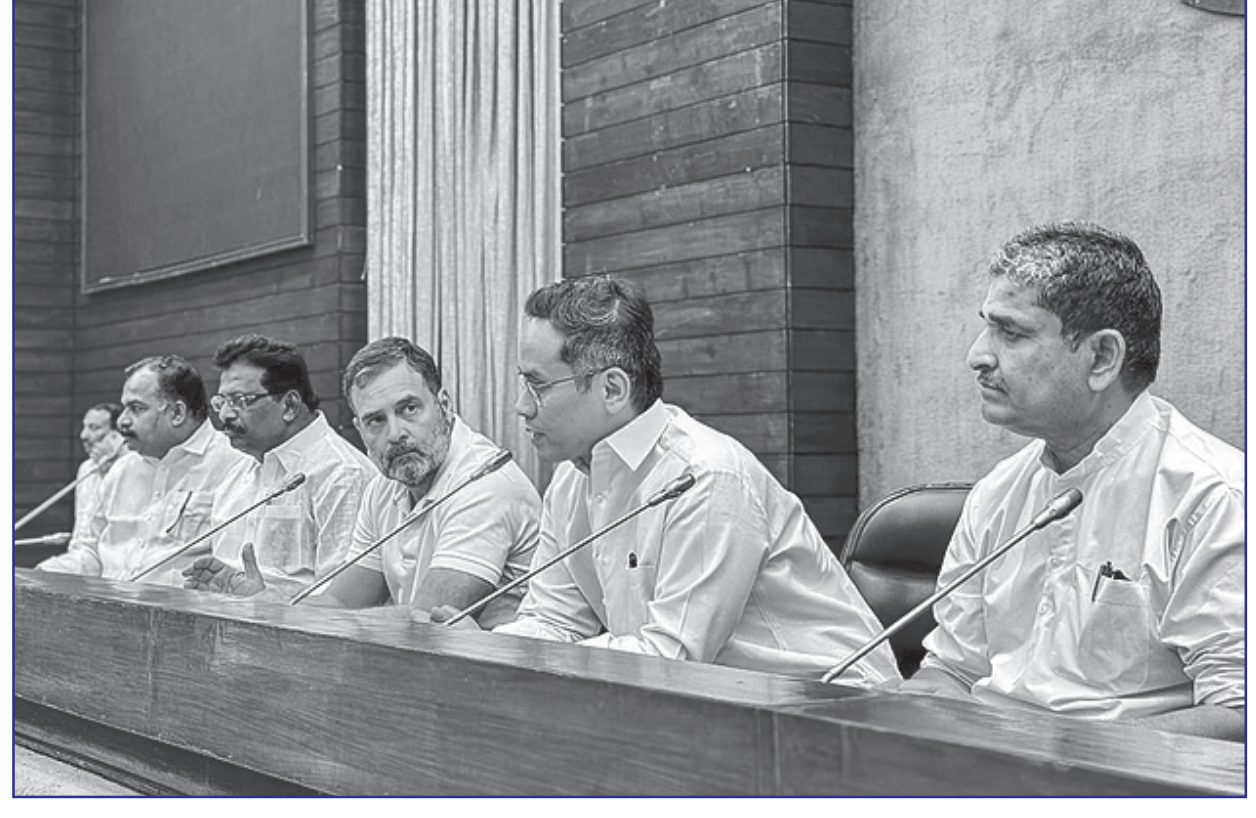
In this image posted by @INCIndia via X, LoP in Lok Sabha Rahul Gandhi during the Congress Parliamentary Party meeting, at Parliament House in New Delhi on Wednesday.

The university students launched a protest recently after the TGIIC began the work to clear the land of trees and rocks for its auction for the development of IT parks.