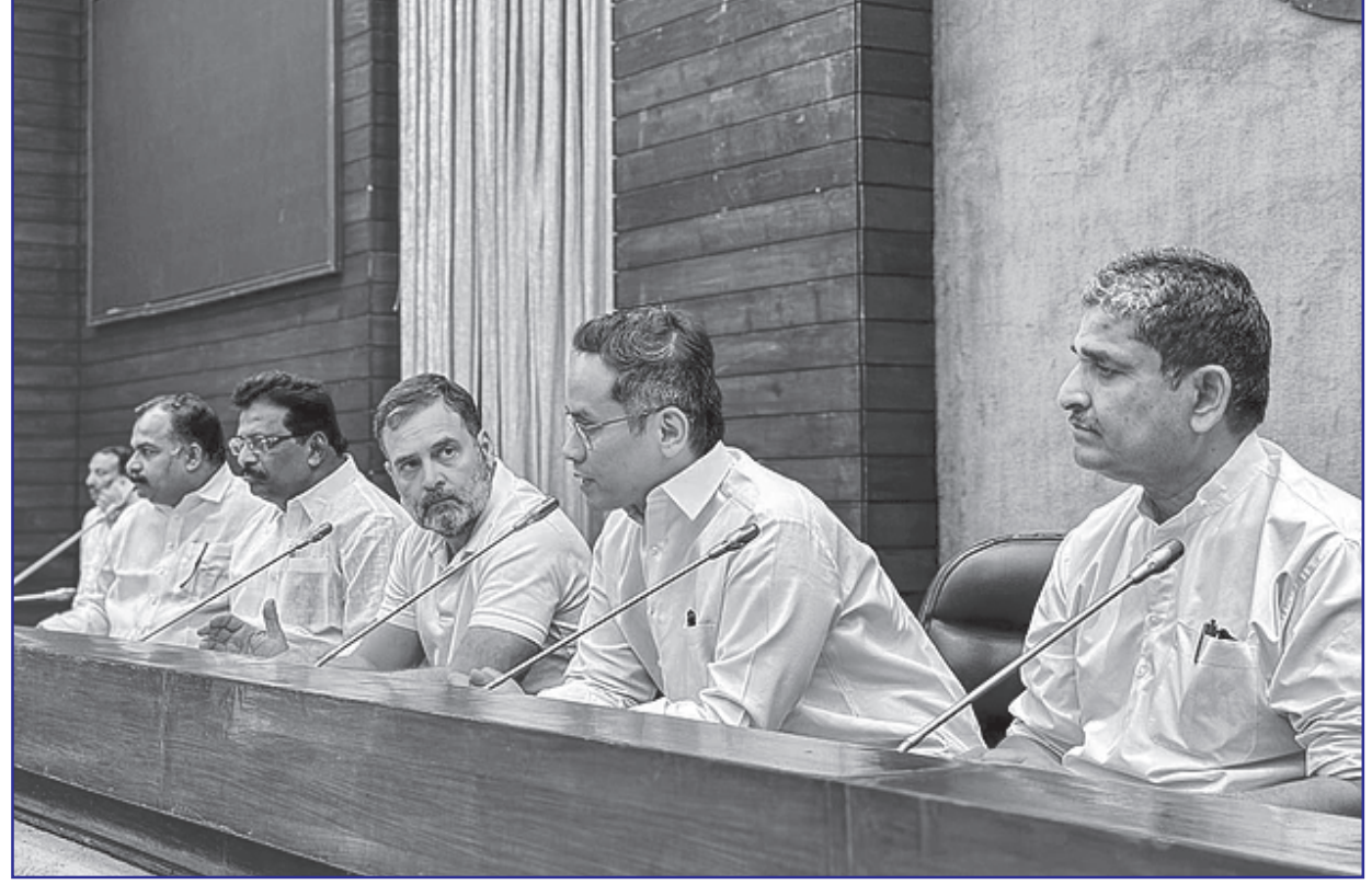
In this image posted by @INCIndia via X, LoP in Lok Sabha Rahul Gandhi during the Congress Parliamentary Party meeting, at Parliament House in New Delhi on Wednesday.

The university students launched a protest recently after the TGIIC began the work to clear the land of trees and rocks for its auction for the development of IT parks.