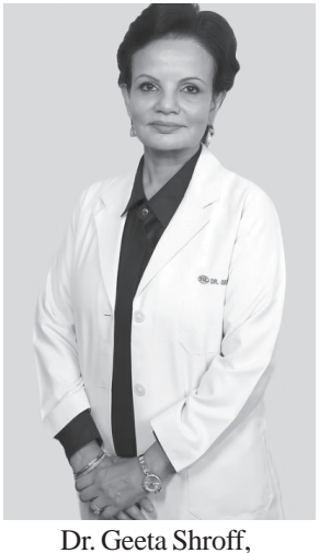
Founder Director -Nubella Centre for Women's Health

(Standard Post Bureau) In the ever-evolving field of reproductive medicine, a new advancement in intrauterine insemination (IUI) has emerged, offering a remarkable success rate of up to 80%, compared to the conventional IUI success rate of approximately 20%. This breakthrough has given renewed hope to countless couples