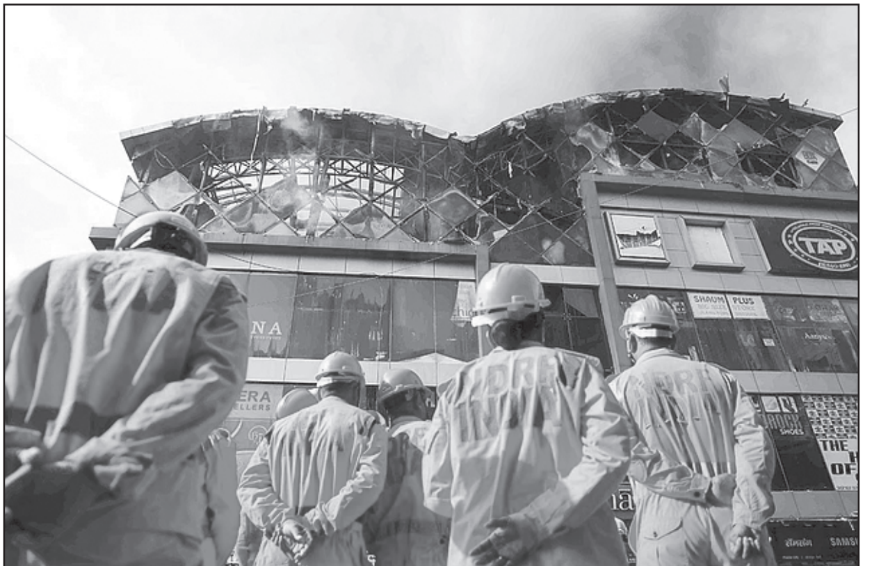
NDRF personnel during a rescue operation after a fire broke out at the Link Square Mall, in the suburban Bandra area of Mumbai on Tuesday.

Mobile: 9517191315, Email: lawyeratmumbai@gmail.com