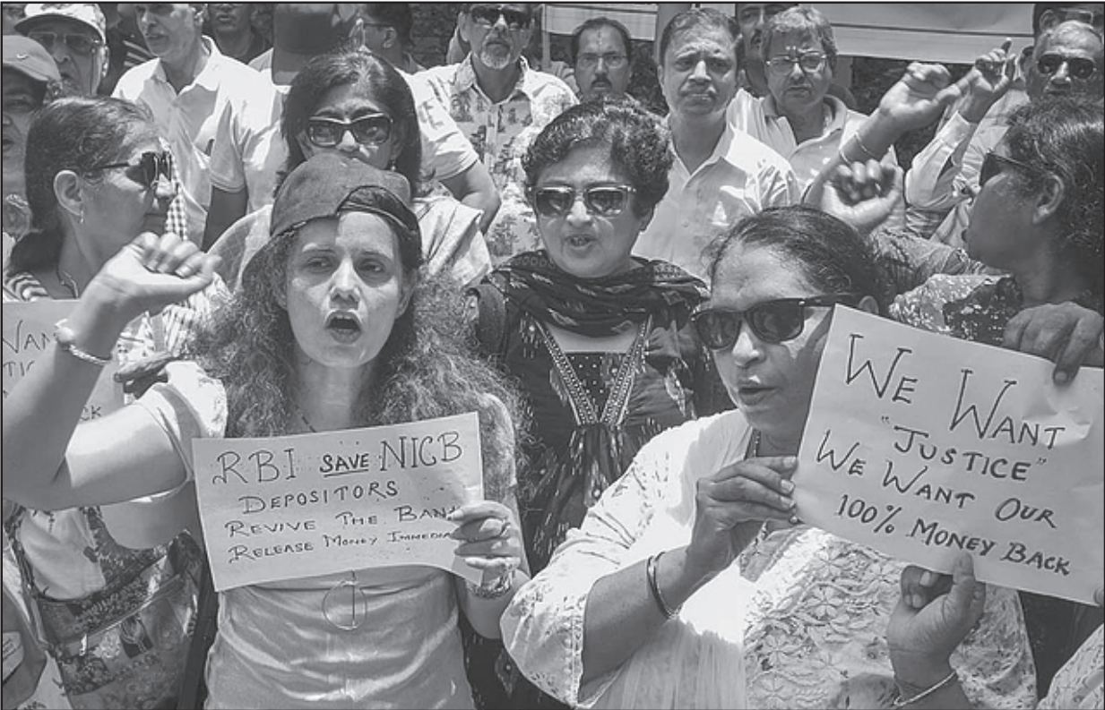
Account holders protest to get their deposits after the RBI's restrictions on the Co-operative Bank Ltd., in Thane.

Mumbai, April 28 (UNI) : Prime Minister Narendra Modi will inaugurate grand event of World Audio Visual Entertainment Summit at Jio World Centre at Bandra-Kurla Complex in Mumbai on May one, informed Maharashtra Industry Minister Uday Samant on Monday. Talking to reporters at BKC, Samant said that the World Audio Visual Entertainment Summit has been organised from May 1 to 4.