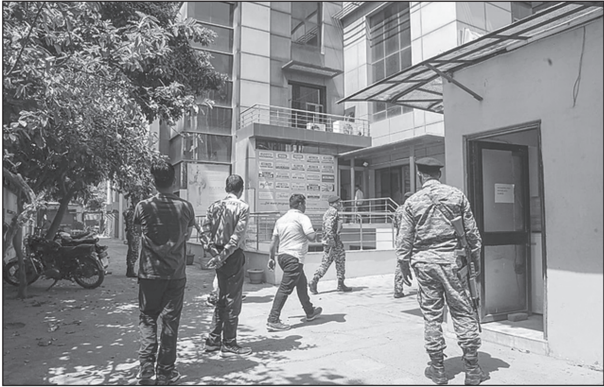
Security personnel guard as ED conducts raids at a FIITJEE centre in Noida on Thursday.