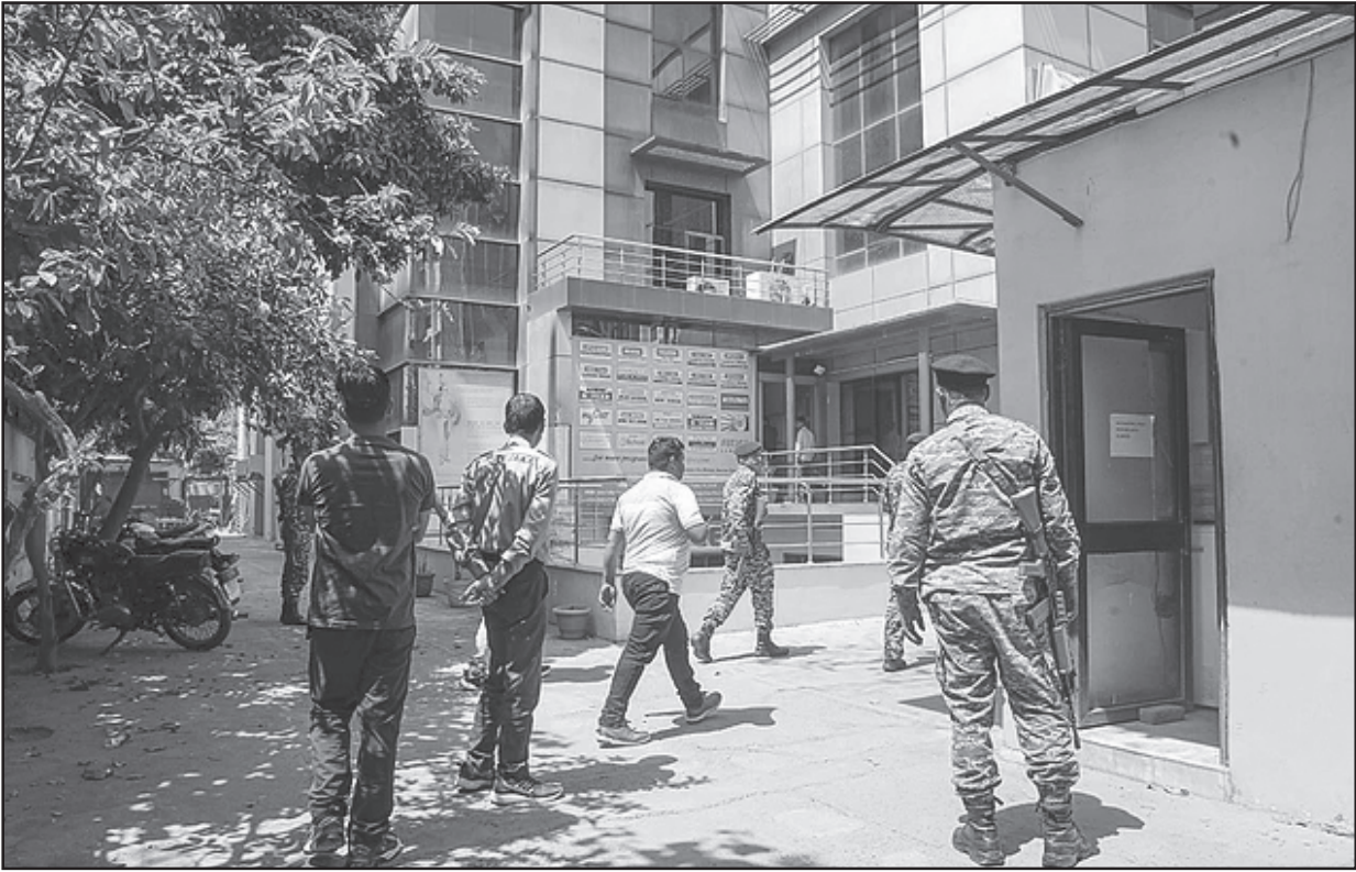
Security personnel guard as ED conducts raids at a FIITJEE centre in Noida on Thursday.