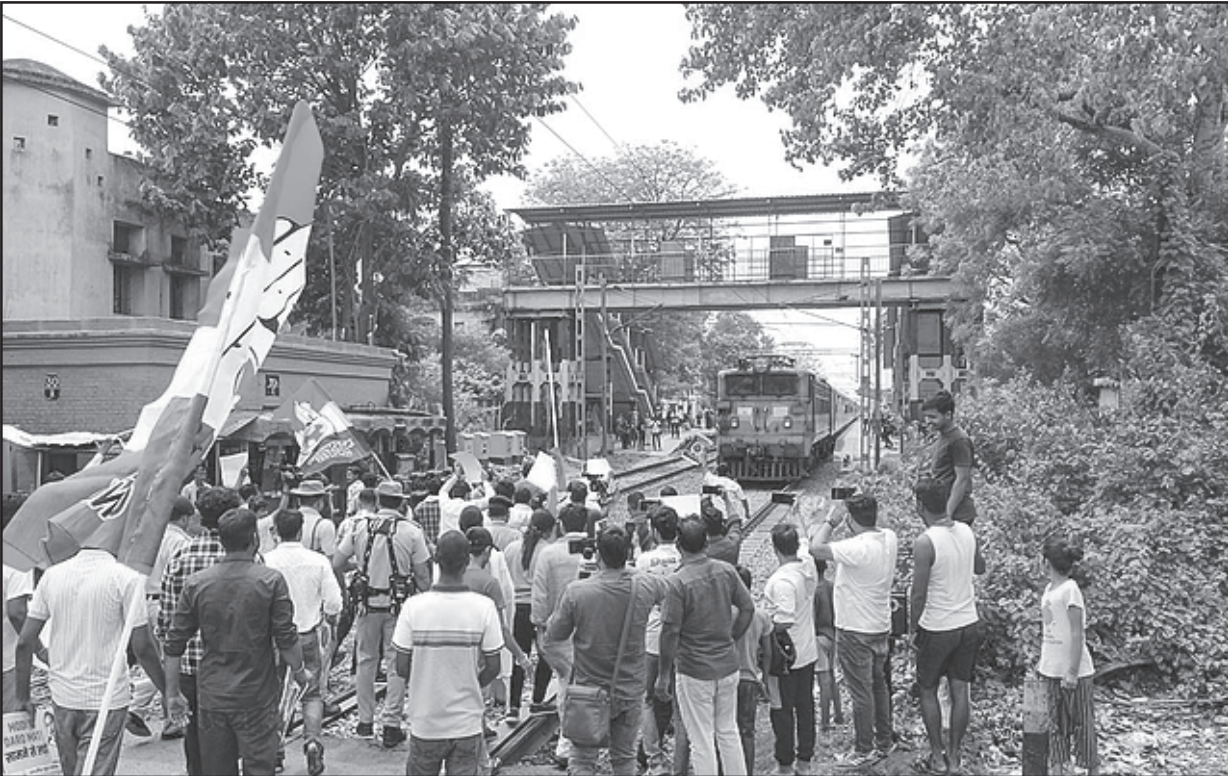
Indian Youth Congress (IYC) activists hold placards during ‘Rail Roko’ protest over the Enforcement Directorate's (ED) chargesheet against Sonia Gandhi and Rahul Gandhi in the National Herald case, in Patna on Friday.

Dhankhar said, “The judges who have issued an order to the President and presented a scenario, it will be the law of the land. The judiciary has forgotten the power of the Constitution.” He said Article 145(3) needs to be amended. (Decisions by) five out of eight judges would mean that the interpretation would be by a majority. “Article 142 has become a nuclear missile against democratic forces, which is available to the judiciary 24x7.”