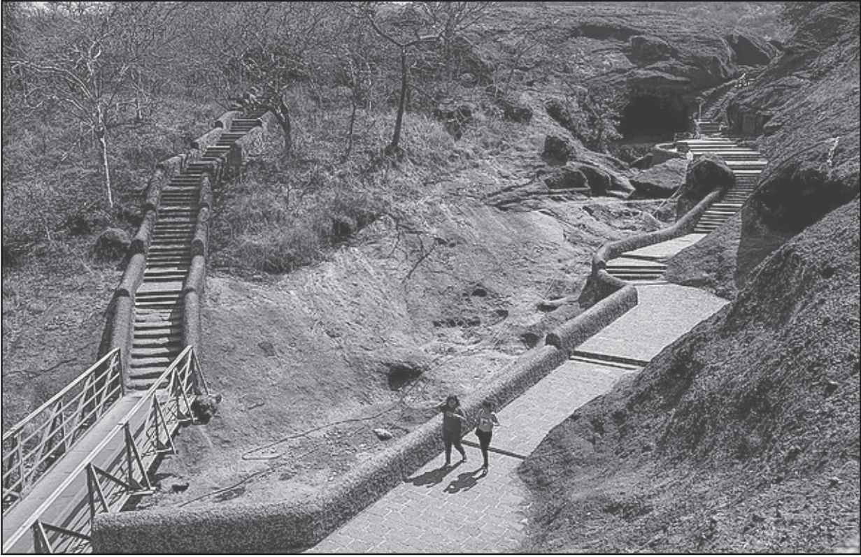
People visit the Buddhist complex of Kanheri Caves, on the International Day for Monuments and Sites, also known as World Heritage Day, in Mumbai on Thursday.