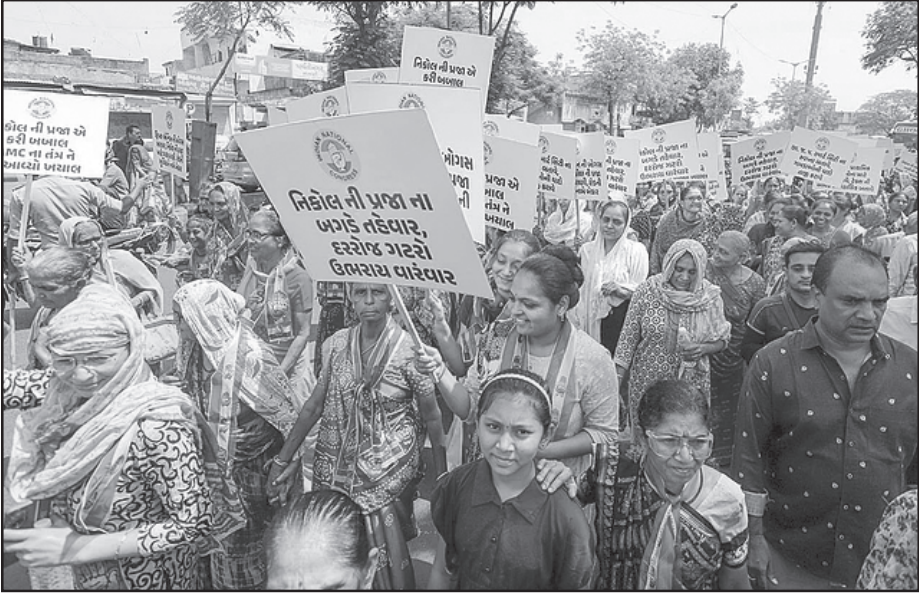
Leader of the Opposition in Ahmedabad Municipal Corporation with counselors and residents stages a protest over drinking water supply and other issues, in Ahmedabad.

authorities noted that the petitioners could not submit the "sanctioned plan" of their houses, which they (NMC officials) prima facie, found that the petitioners did not construct the structures as per a sanctioned plan from the NMC. Therefore, a show-cause notice was issued to them giving a deadline of a day to respond to the show-cause notice. "I say and submit that in the present case, me and my officers had not acted with any malafide intention against the petitioners or their properties but acted in accordance with the prevailing situation and strictly in accordance with the statutory provisions of the Slums Act, 1971," the affidavit stated.