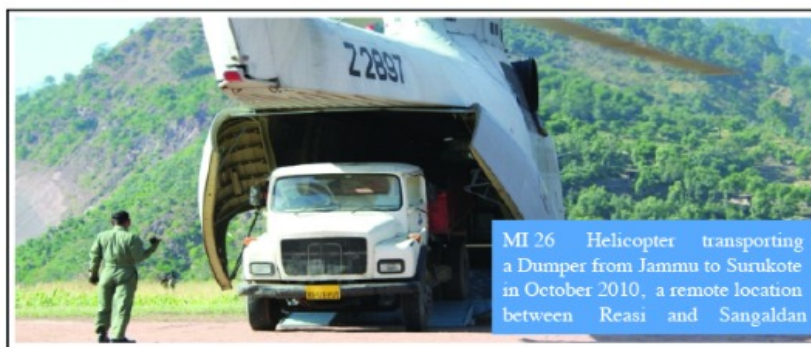
MI 26 Helicopter transporting a Dumper from Jammu to Surukote in October 2010, a remote location between Reasi and Sangaldan