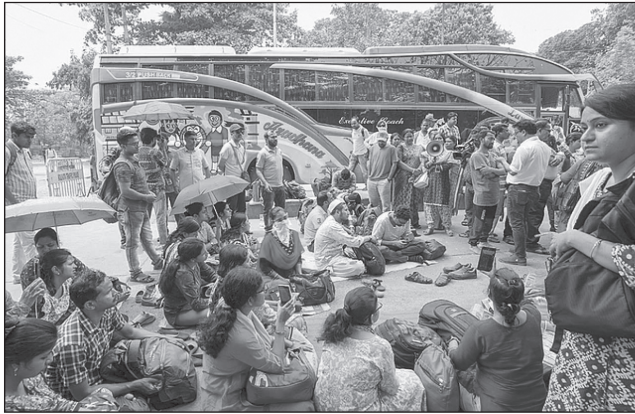
A section of teachers rendered jobless by a recent Supreme Court verdict, before boarding a bus for Delhi to broaden their agitation beyond West Bengal, in Kolkata. The teachers plan to hold a sit-in at Jantar Mantar on Monday.

In a message to the administrative machinery, the Chief Minister warned