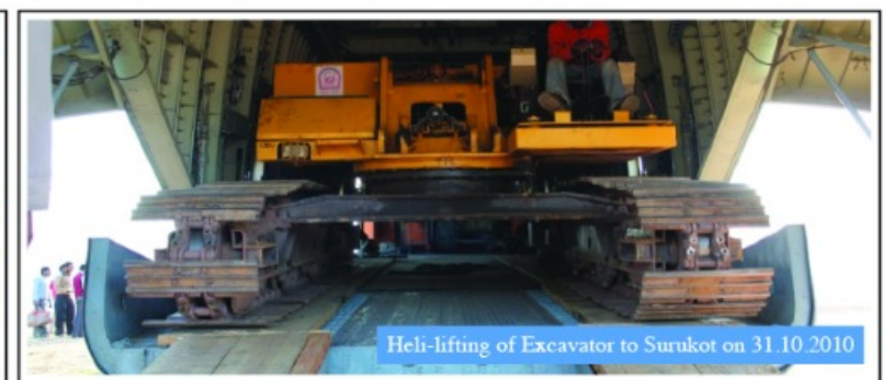
Heli-lifting of Excavator to Surukot on 31.10.2010