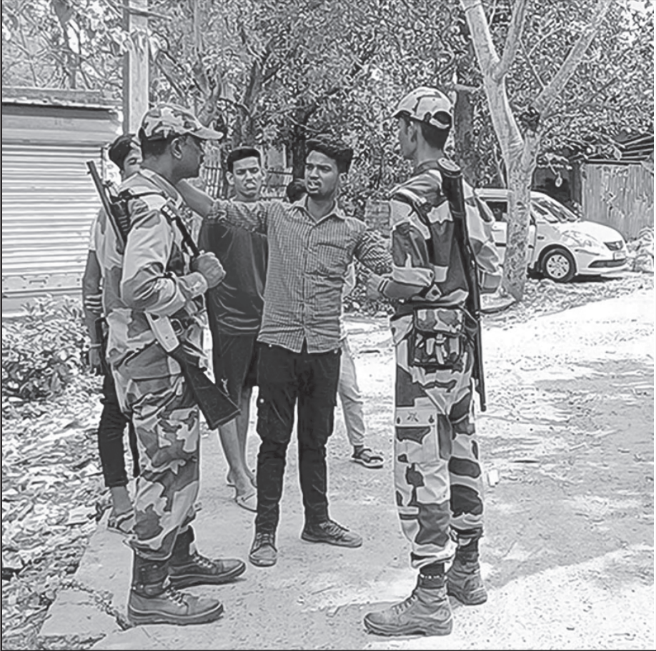
BSF personnel interact with locals as they guard in a violence-hit area at Jangipur, in Murshidabad district of West Bengal. Violence erupted in the area following protests over Waqf Act.

Police also seized seven Android mobile phones, one keypad mobile, Rs 1.64 lakh in Indian currency, and 1,01,935 Bangladeshi Taka from their possession.