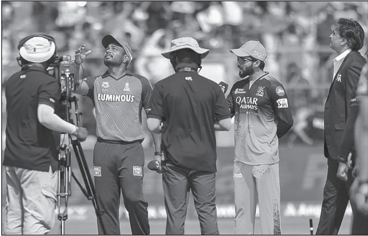
Rajasthan Royals' captain Sanju Samson and Royal Challengers Bengaluru's captain Rajat Patidar at the toss before the start of the Indian Premier League (IPL) 2025 cricket match between Rajasthan Royals and Royal Challengers Bengaluru, at Sawai Mansingh Stadium, in Jaipur.

The event will be publicised through the press, social media, WTA website worldwide and telecast in over 60 countries around the world, arguably the highest range of publicity for