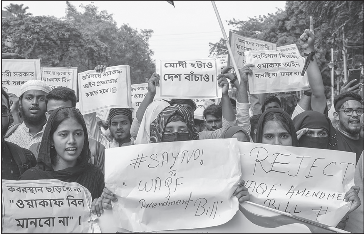
Students of Aliah University take part in a protest rally against the Waqf (Amendment) Bill 2025, in Kolkata on Friday.