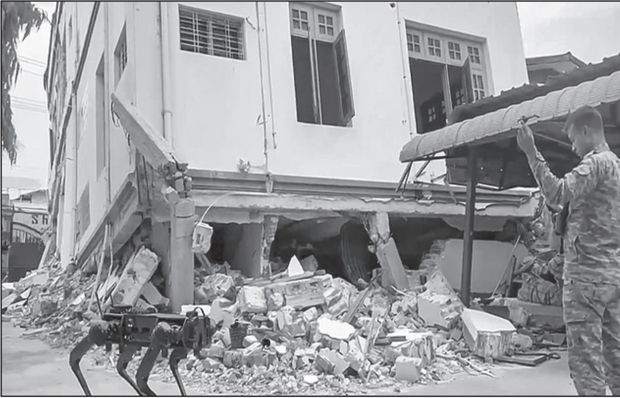
An army personnal uses a robotic mule for rescue operation in earthquake-hit Myanmar on Friday.

"On 10 April, the United States issued the Executive Order, announcing a further increase of the so-called 'reciprocal tariff' on Chinese products. China filed a WTO complaint against United States' latest tariff measures," a statement from China's mission said.