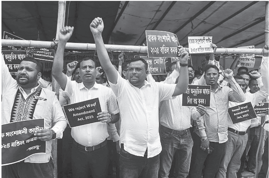
Activists of All Assam Minority Students Union (AMSU) stage a protest against the passage of the Waqf (Amendment) Bill by Parliament, in Guwahati on Wednesday.