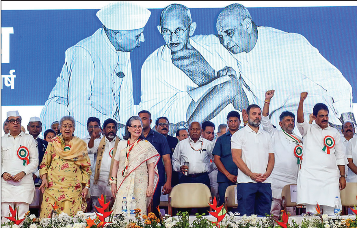
Congress Parliamentary Party Chairperson Sonia Gandhi, LoP in Lok Sabha Rahul Gandhi and other leaders during the All India Congress Committee (AICC) session at the Sabarmati Riverfront Event Centre, in Ahmedabad on Wednesday.

Ahmedabad, April 9 (UNI) : Leader of Opposition in Lok Sabha, Rahul Gandhi, on Wednesday criticised Prime Minister Narendra Modi over the tariffs imposed by US President Donald Trump on Indian imports. Addressing the AICC session here, Gandhi asked, "Where is Modi hiding? Who used to boast about his friendship with Donald Trump?" Moreover, Gandhi also slammed BJP-RSS alleged polarising agenda. He quoted the recent incident in Rajasthan involving the CLP leader Tika Ram Jully's visit to a temple, which was later washed by one of the BJP leaders, because Jully belongs to the Dalit